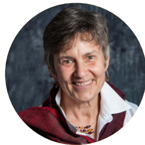
ANN BANCROFT Founder Bancroft Arnesen Explore